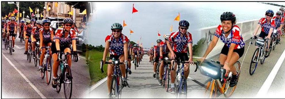
A SPIRITUAL BICYCLE ADVENTURE BEYOND BELIEF

River Community Church will be opening our doors to give the youth and their adult chaperones a place to sleep for the night. They will be arriving at the church at approximately 4:00 PM on Wednesday, June 28th. We would like to give them a heartfelt RCC welcome and provide a cookout dinner for them as well as get to know them and make them feel at home.